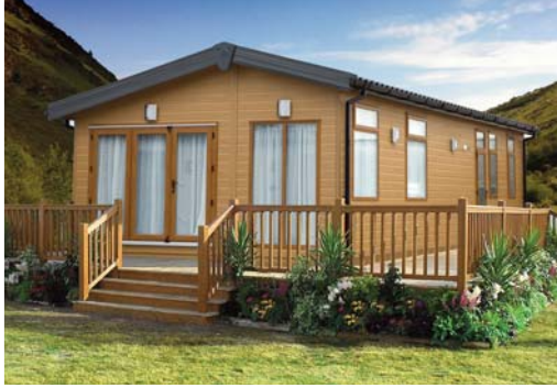
42 x 16 2 bedroom